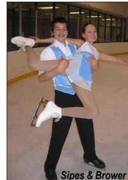
Sipes & Brower