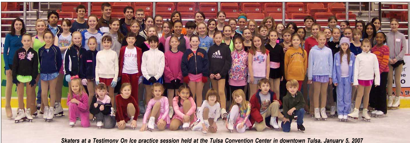
Skaters at a Testimony On Ice practice session held at the Tulsa Convention Center in downtown Tulsa, January 5, 2007