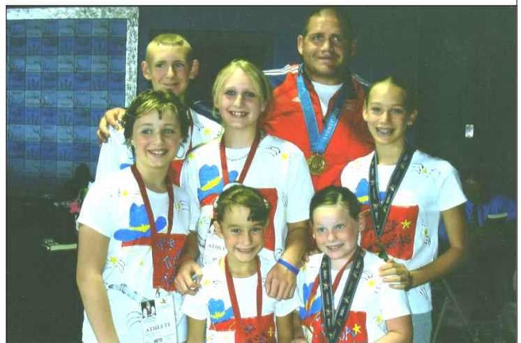
TFSC Members at State Games Of America 2005 with Olympic Champion Wrestler Rulon Gardner

Competitors placing first, second or third in their respective events will have the opportunity to advance to the State Games of America in August, 2007 to be held in Colorado Springs, Colorado. The State Games of America is an elite grassroots multi-sport festival that is the culmination of the 49 State Games events across the country. Nearly 10,000 athletes competed in 2005.